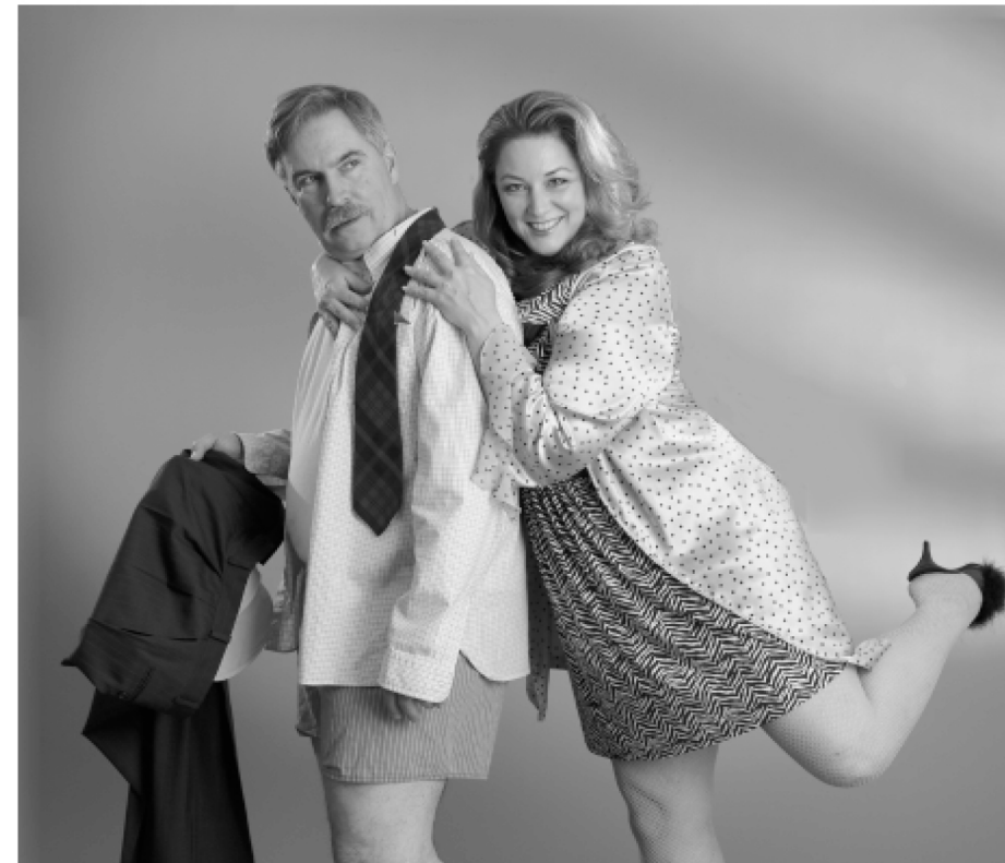
Produced by special arrangement with Samuel French, Inc.